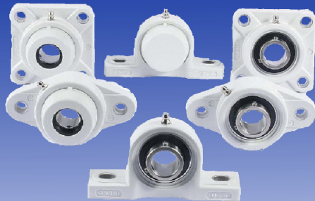
Stainless / Thermoplastic Series