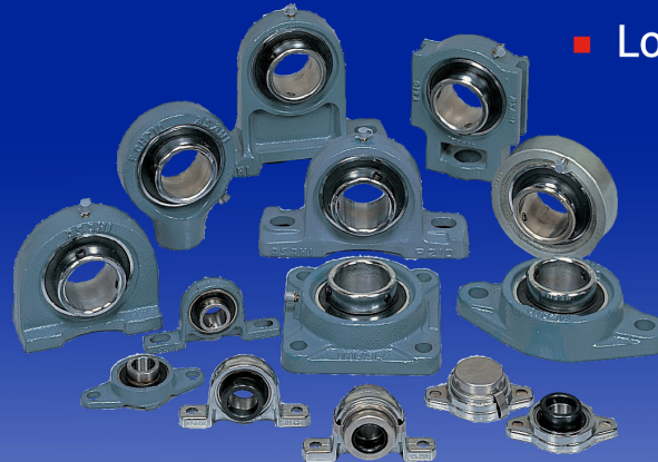
Cast Iron High Temperature Series